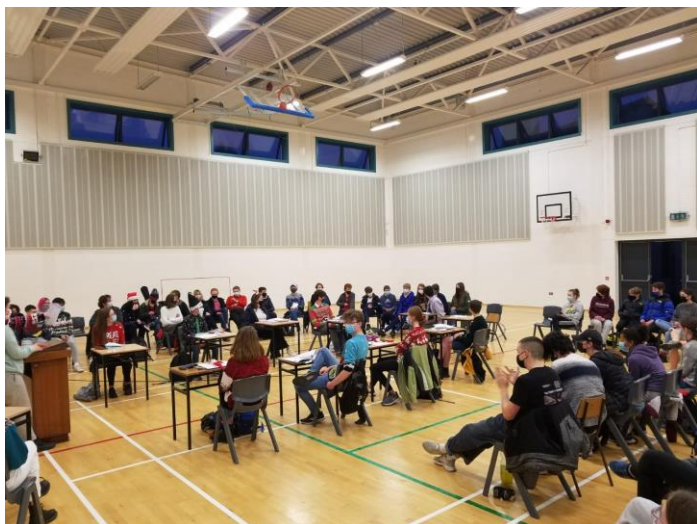
The Christmas debate...